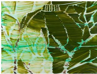
Gas dome 2021