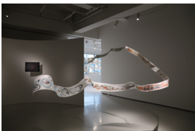
What Sounds Look Like to Me 2021