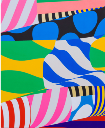
untitled 2017 Private collection

Concurrent exhibitions: From the Terada Collection 076 Highlights from the Terada Collection (Part 1), project N 90 Yamaguchi Yuiha