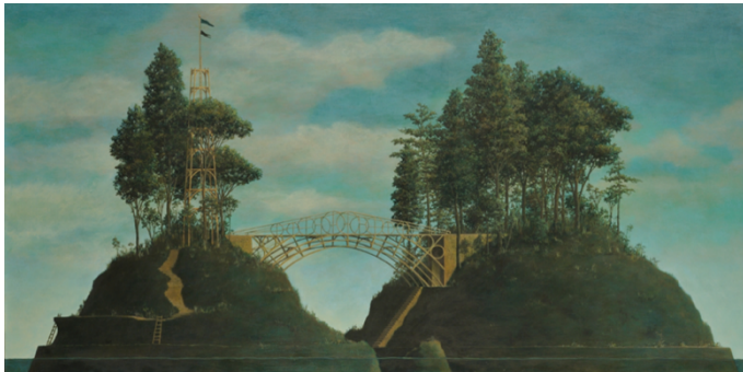
Land-Escape-10 1992

Concurrent exhibitions: From the Terada Collection 076 Highlights from the Terada Collection (Part 2), project N 91 Kobayashi Saori