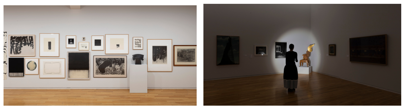
Collection Exhibition curated by Ryan Gander: Colours of the imagination installation view 2021 photo:NAKAGAWA Shu Collection Exhibition curated by Ryan Gander: All our stories are incomplete...installation view 2021 photo:NAKAGAWA Shu

Eventually, it was decided to present two concurrent exhibitions with different themes, All our stories are incomplete... on the 3rd floor and Colours of the imagination on the 4th floor. And as a result of giving the museum over to ideas that could only have come from Gander, each of these collection exhibitions was a surprise. Taking inspiration from the fact that the Tokyo Opera City Art Gallery's collection is a private eye collection by the late Terada Kotaro, Gander produced an exhibition that brought the focus onto Terada's gaze. Ryan Gander asserts that every human has the ability to understand the same thing in multiple ways. His collection exhibition for 2022 will surely bring new surprises, too.